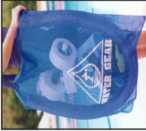
Mesh Zippered Tote Bag